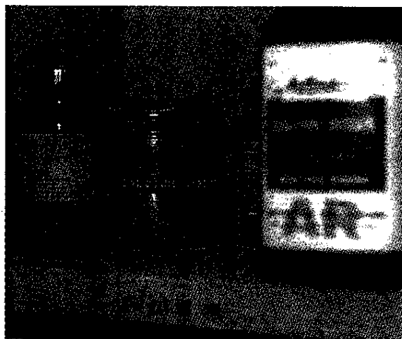
Figure 1. Calcium carbide stored in a glass container with a high brass content metal lid. Note the bulging lid indicating acetylene gas inside the container.

A commonly used characterization test for aldehydes requires Tollen's reagent which is a solution containing silver nitrate, dilute sodium hydroxide, and ammonium hydroxide. Tollen's reagent solution, if stored for too long, can become unstable and explosive. An explosion occurred as a student put a pipette into a storage bottle of Tollen's reagent that was not freshly prepared. 15 Several students were hospitalized with eye injuries as a result of