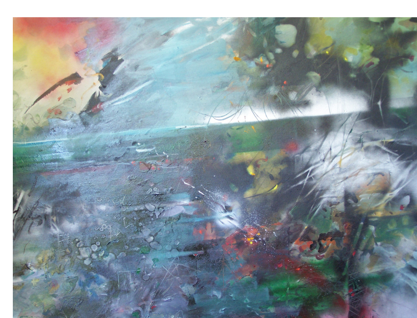
Sanctum Sanctorum, 2004, oil on canvas, 48 x 36 in.

Essential W. Carl Burger could have been crafted as a narrative exhibition of works spanning the six decades of this artist's prolific career, starting out with a few early renderings of French landscapes or European architecture seen through the eyes