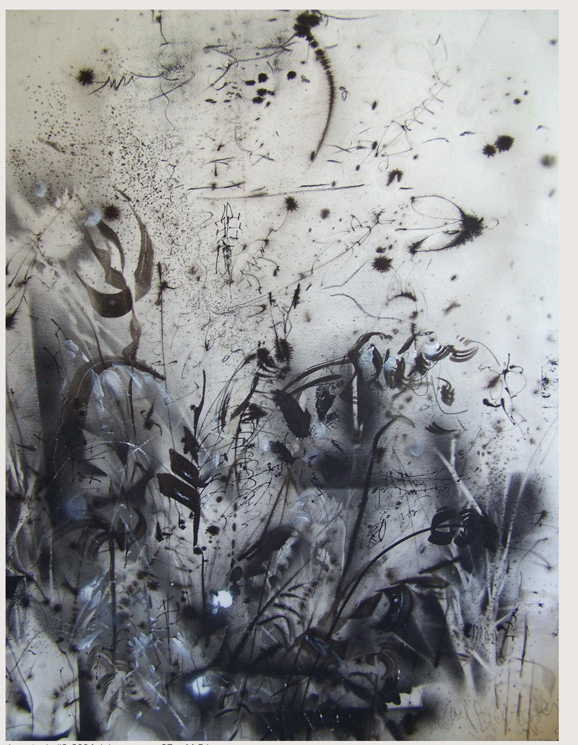
Insectuals #3, 2004, ink on paper, 37 x 44.5 in.