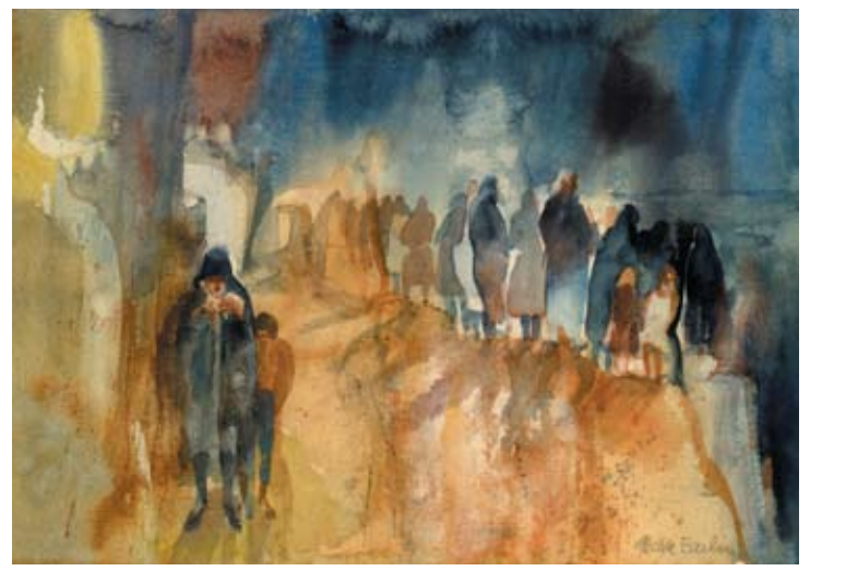
Gathering date unknown