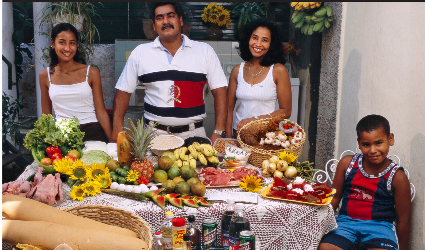
Peter Menzel, Cuba— Family Portrait , c. 2005, lightjet print, 30 x 45 inches, courtesy the artist