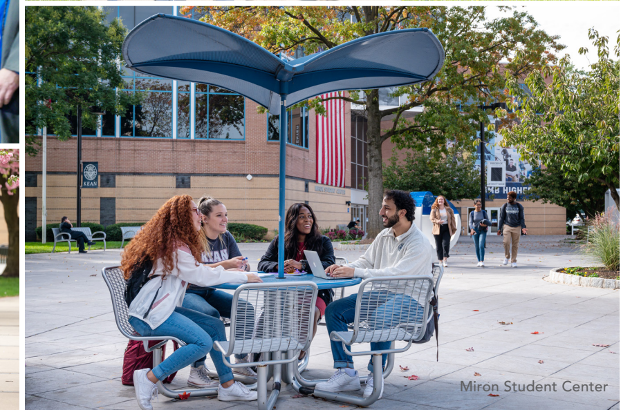
Miron Student Center