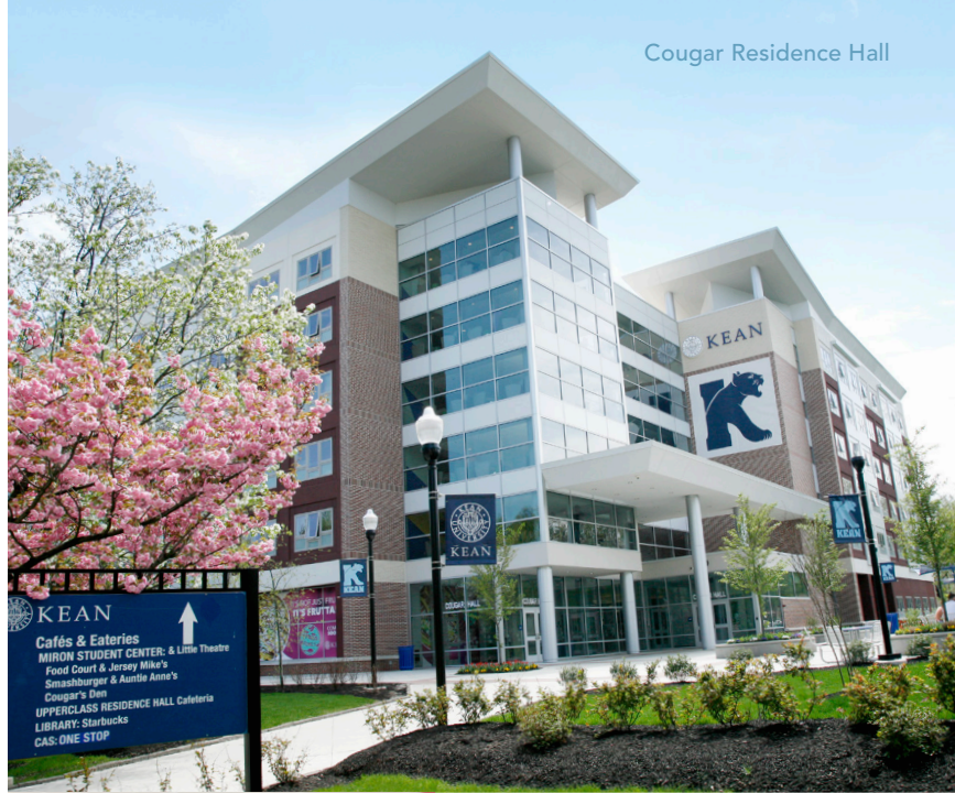
Cougar Residence Hall