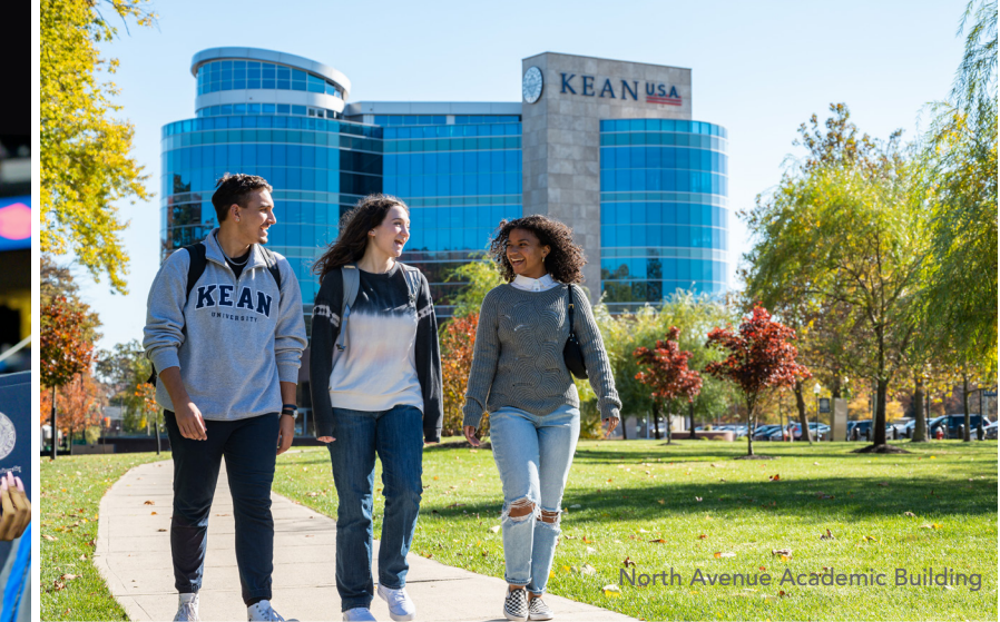
North Avenue Academic Building