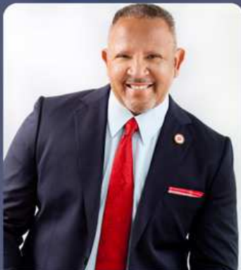
MARC H. MORIAL President and CEO National Urban League KEYNOTE SPEAKER