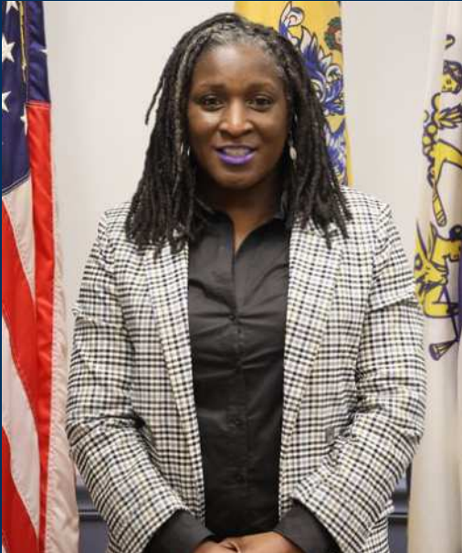
Pillar 1 - Room 139