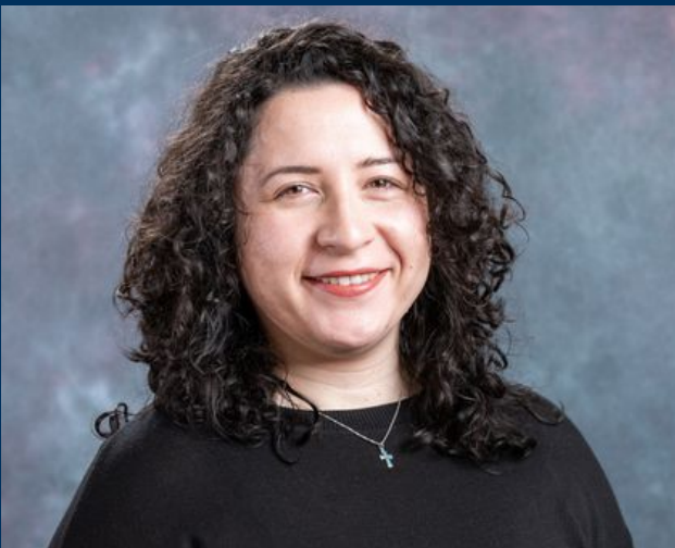
Pillar 1 - Room 109