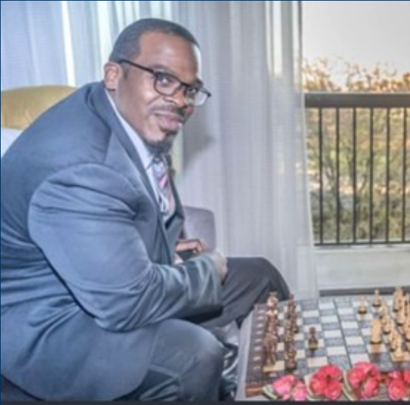
Pillar 2 - Room 207