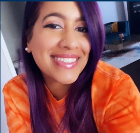
Pillar 1 - Room 115

As deputy mayor at the intersection of public safety, public health, and municipal government, her new position will foster a pinpoint focus on community-based public safety strategies, protocols, systems, trainings, and investment sustainability, while allowing the state and federal networking necessary to share Newark's policies, move legislation and garner appropriations funding.