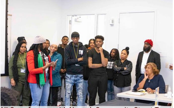
NLC conference with Newark Community Street Team

Our ecosystem's importance is critical to our efforts as they understand first-hand that it is society's neglect of the underlying causes and conditions for suffering and discontent that prevents harmony and peace.