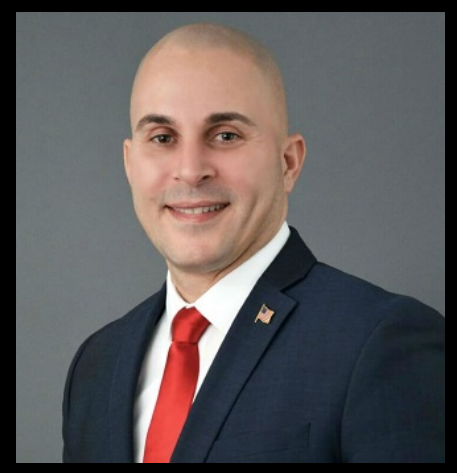
Honorable Helmin J. Caba, Mayor, City of Perth Amboy