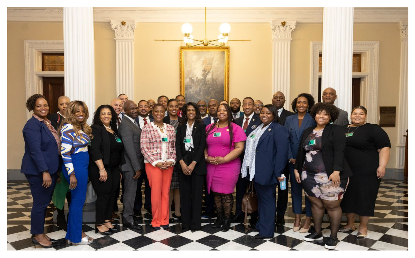
Members of the New Jersey Urban Mayors Association and staff members of the John S. Watson Institute for Urban Policy and Research

NJUMA members also participated in Communities in Action: Building a Better New Jersey, a White House-led series that brings together local elected officials and community leaders to highlight the investments of the Biden-Harris Administration and their impact in communities throughout the country. The series amplifies the voices and examples of local leaders who are delivering real results for working families. The NJUMA members shared the ways that the administration is supporting their local efforts to create opportunities and improve people's lives.