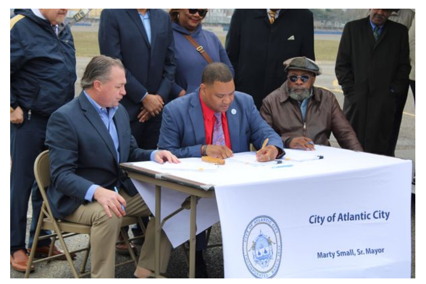
Signing of the Memorandum of Understanding at Bader Field.

In a gambling town like ours, you need to take chances, and this is one I truly believe will pay off. This has not been an easy road, but as is the case with anything in life worth having, without struggle there is no progress. I never gave up on this because "surrender" is not a term in my vocabulary. Being able to sign that Memorandum of Understanding, on site, in front of a full slate of media and many of the individuals who helped make this a reality, was not only a great day in the City of Atlantic City, but it was a historic day as well.