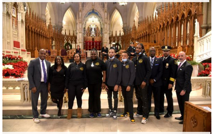
Police Graduation with OVPTR Social Workers