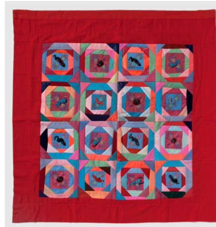
Homemade Baby's Quilt , n.d., cotton, embroidery thread, 32 3/4 x 34 inches, private collection.