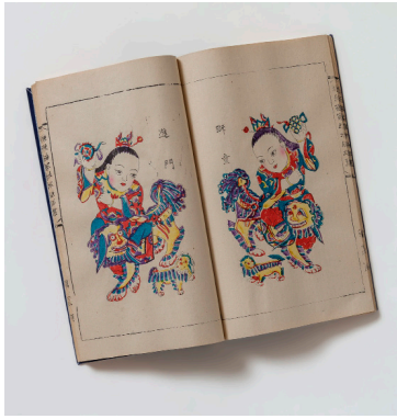
Collection of New Years Prints, n.d., 10 1/4 x 11 1/4 x 2 inches, private collection.