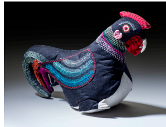
(Top) Baby Tiger Shoes , n.d., cotton, embroidery thread, 3 1/4 x 3 1/4 x 5 3/4 inches, private collection. Photo: E.G. Schempf. (Bottom) Stuffed Rooster , n.d., cotton, embroidery thread, straw filling, 10 3/4 x 10 1/2 x 5 1/2 inches, private collection. Photo: E.G. Schempf.