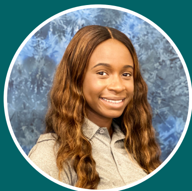
RA CHANTE DECEMBER/JANUARY