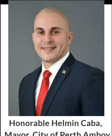
Mayor, City of Perth Amboy

By Lisett Lebron, Chief of Staff, City of Perth Amboy