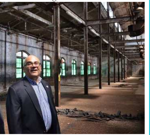
Mayor Reed Gusciora at Roebling 20Block 20II