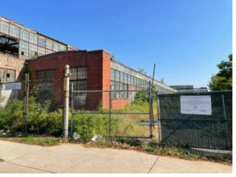
Roebling 20 Block 2011