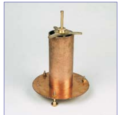
Stilling well with micrometer

The amount of evaporation is a function of temperature, humidity, wind and other ambient conditions. In order to relate the evaporation to wind current or expected conditions, the maximum and minimum temperature as well as the amount of air passed are recorded with the evaporation. For a more exact use of the evaporation pan it is recommended to use an additional wind path meter.