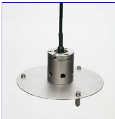
Level sensor for automatic measurement

For automatic measurement of the evaporation use can be made of a level sensor. The level sensor consists of a sensitive pressure transducer built in a stainless steel housing. The sensor has a pressure range of 0-20 mbar, accuracy 0,25%. Output signal 0-20 mA, power supply voltage 8-28 V. The sensor is supplied with 5 m cable.